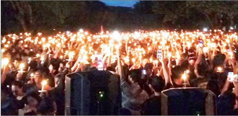
Fig. 7. Conservative Hindu Balinese Protestors Brandishing Mobile Phones

The solution is to aspire for unity in diversity. This is not a contradiction in terms. Indeed, unity without diversity is meaningless, because a unity based on sameness has no communicative and rational potential. Diversity without unity also precludes communicative and rational potential. One basic fallacy is the ill-advised desire to eradicate difference until interlocutors have nothing left to say to one another, while the other fallacy is to radicalise difference to the point of eliminating the possibility for communication and cooperation, just when it is needed more than ever.