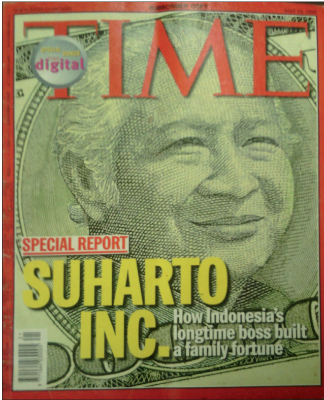
Fig. 3. President Suharto: Globalism and Captive National Elites

The globalising attitude many developing nation states direct at their own local societies and citizens is in part tied up with the nation building projects of national elites, but in large part it is also a reflection of the use of the nation state by external forces as an instrument of a globalisation. For example, the structural adjustment programs mandated by the Bretton Woods institutions, IMF and World Bank, as a condition for granting credits to developing countries, would not have been implemented without the complicity of captive national elites in those countries. In short, the developing nation state sometimes has globalised for its own