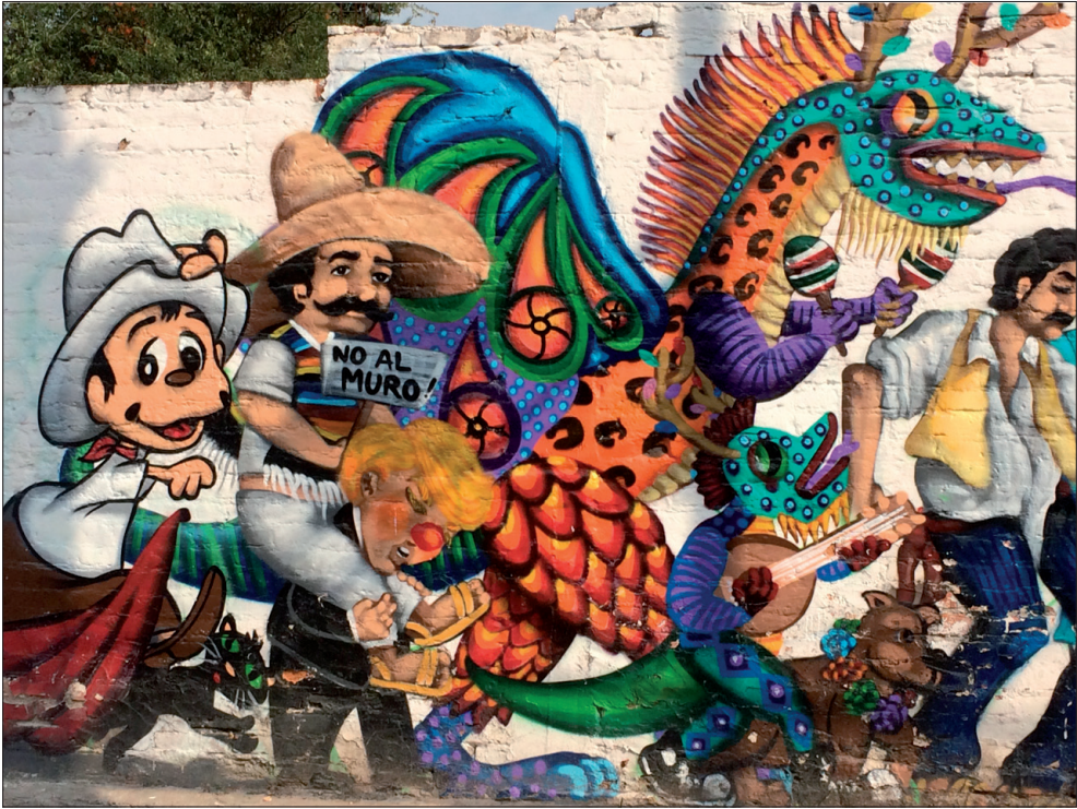
Fig. 6. Trump's 'Great Wall of America', caricatured in Mexican graffiti art

brothers billions and will cause a huge loss of state revenue that could otherwise have been used to provide social and health services for ordinary people, such as those who voted for Trump. Deflecting blame for the adverse effects of globalisation upon vulnerable outsiders such as immigrants and the poor, and promising to build higher walls to keep outsiders away, is the favoured strategy to cover such acts of duplicity.