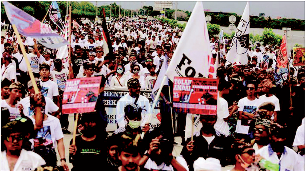
Fig. 2. Balinese local revitalisation movement protesting national development project

two extreme points of the scale. We need to remember, however, that nationalism is Janus-faced because it sits somewhere in the middle of this scale. It thus may simultaneously adopt a xenophobic attitude, facing out toward the global, and a globalising attitude, when facing inward toward local peoples, especially members of ethno-cultural and religious minorities. And of course, there are also movements advocating an alternative globalism, such as international revivalist Islam.