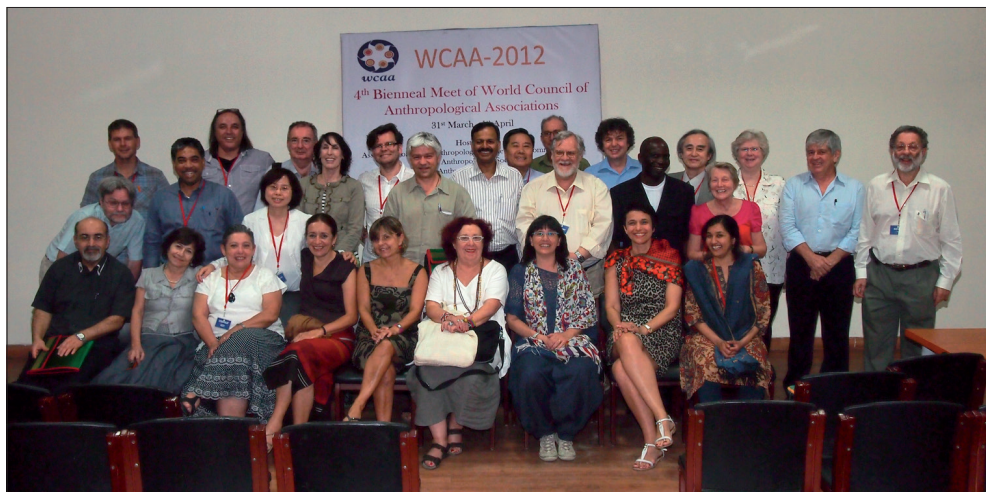
Fig 8. Meeting of the World Council of Anthropological Associations, Delhi, India 2012.

appeals to the local perspective, in that sovereign cooperation partners have the right to be culturally distinct and free of unlawful coercion by outsiders. Cooperation appeals in a positive way to the global perspective, because sovereign cooperation unites diverse peoples as equals who nevertheless recognise their interdependence and the benefits of mutual support and insurance, and thus voluntarily cooperate on a basis of mutual respect and trust. Sovereign interlocutors need not be afraid of others, and hence they will spontaneously cooperate. They will appreciate the common ground of the human condition they share with others, and yet they will also appreciate the hard fact that their cooperation is meaningful and fruitful only where there is the freedom to be different. Sovereign cooperation recognises and safeguards those complex ties of interdependence that are characteristic of contemporary civilisation, and it also celebrates and safeguards the freedom of choice and open-ended nature of knowledge that is embodied in the diversity of human cultures.