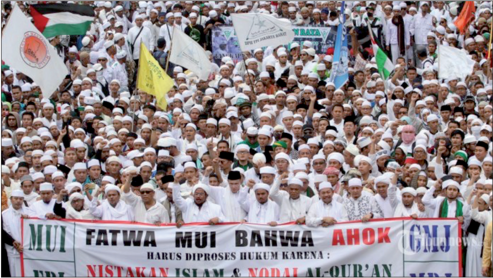
Fig. 1. Muslim protesters demanding Governor 'Jokowi's indictment